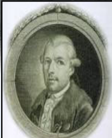
Illuminati founder Adam Weishaupt

*Note: In the year 1776, a man named Adam Weishaupt started a secret society called the Illuminati. The word means “enlightened”. Weishaupt’s enlightenment came from his study of the mystical religions of Egypt and Babylon, which tells that his inspiration was from Satan and not God. This group enlisted many wealthy people from Europe, one of them being banker Mayer Rothschild. As the order grew into power, it almost took control of all Europe until they were exposed and banned by Karl Theodor in 1785. Their ultimate goal was to bring about a NEW WORLD ORDER where a hand full of elite men would control the governments and churches of society.